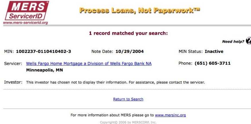
Figure 2: MERS loan search web page screenshot (May 26, 2011), in response to query based on MERS identification number (“MIN”), no investor disclosed: